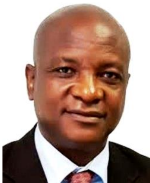
Member – Ghanaian