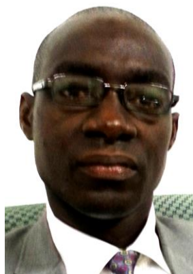
Member – Ghanaian