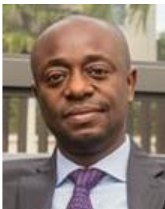
Member - Ghanaian