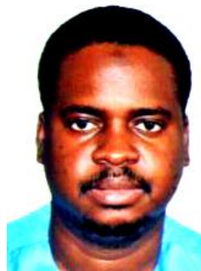
Member – Ghanaian