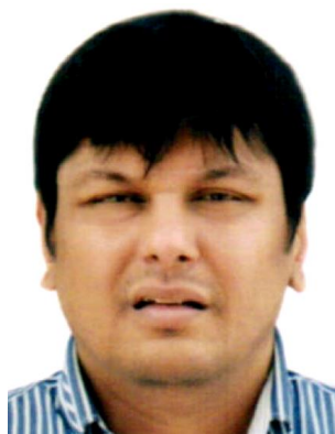
Member – Indian