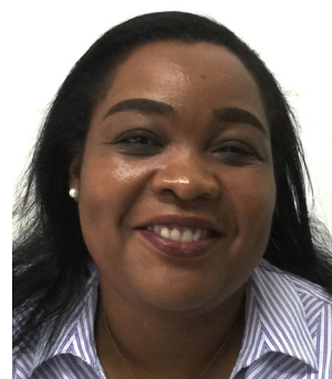
ACCRA NOMINEES LIMITED COMPANY SECRETARIES