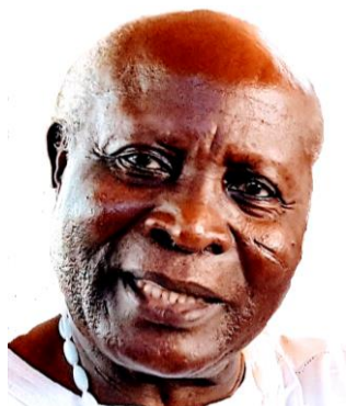
Member – Ghanaian